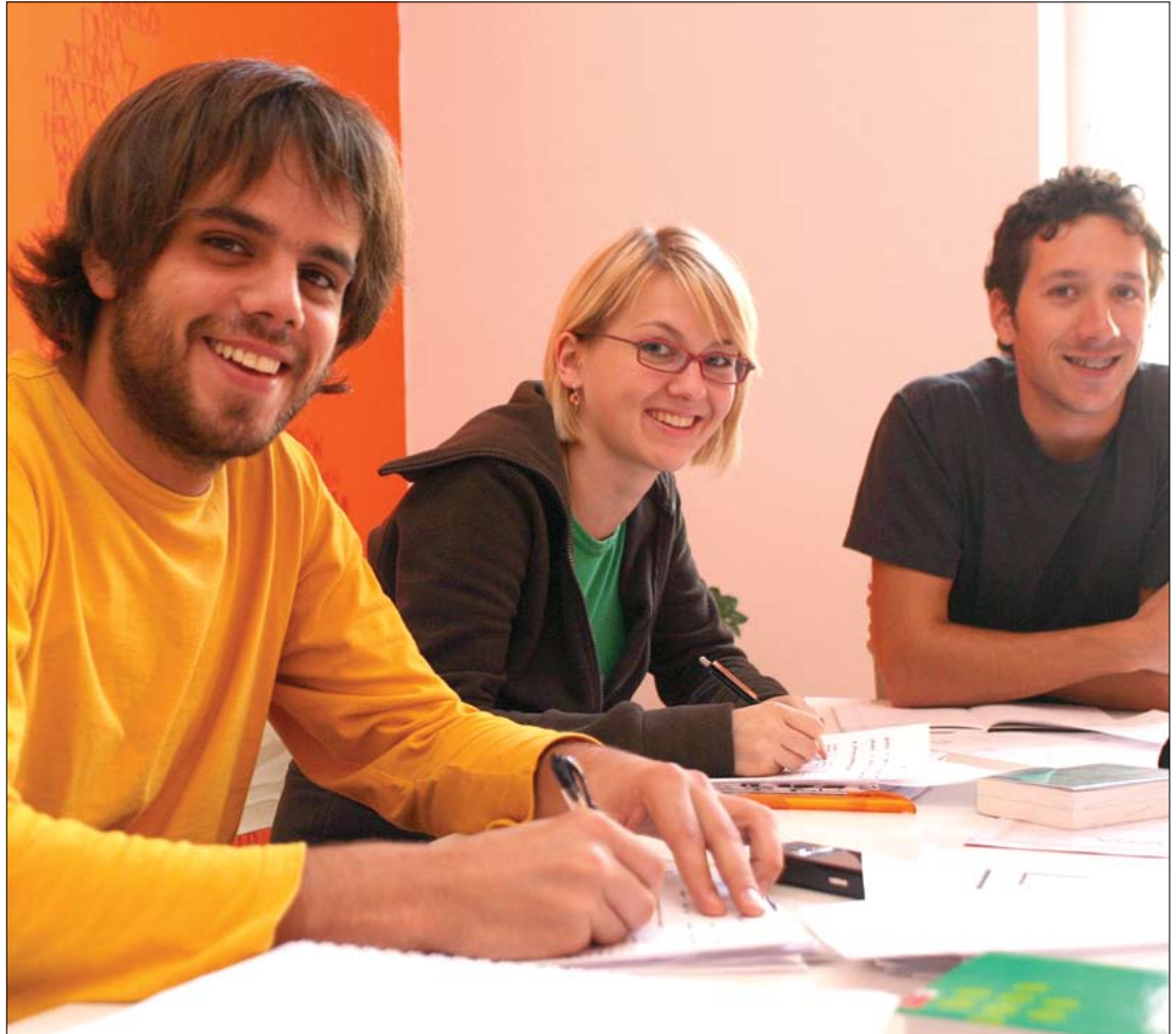
More and more foreigners are learning Polish in Krakow. Much of the interest in learning the language is connected with Poland's entry into the EU.

Discounts on drinks with this ad. Credit cards accepted.